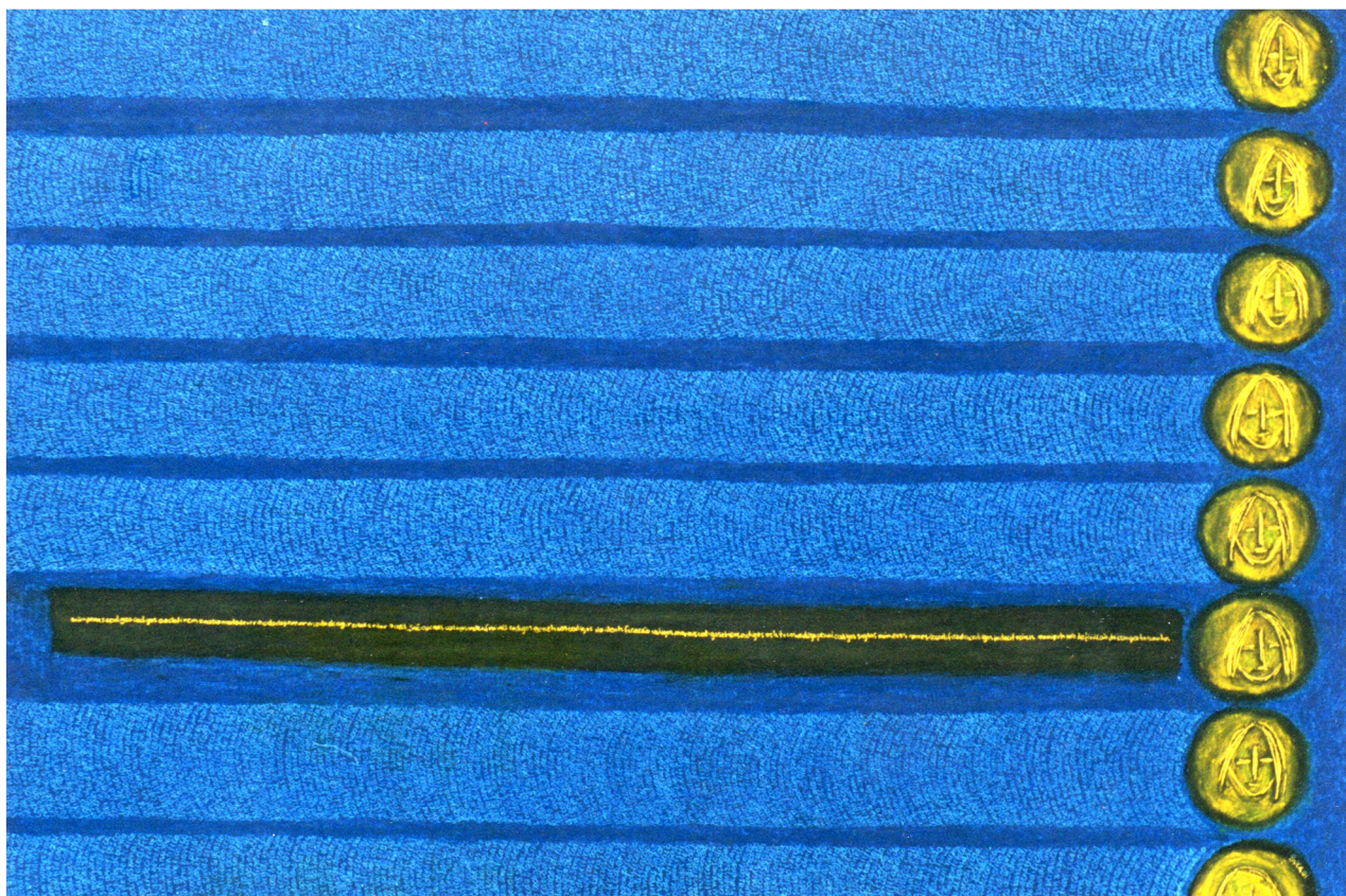
Addiction - Oil Pastel on paper - 2001 35 x 50cm

Exhibition Metaphour of the Unconscious - Curitiba Cultural Foundation - Parana - Brazil